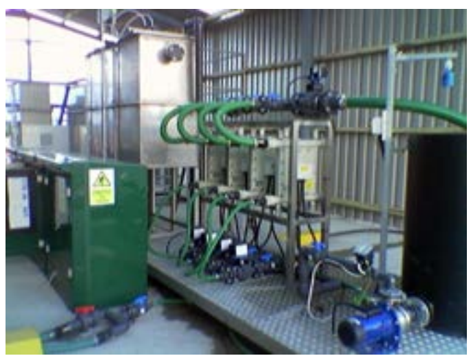
Installation of 4x electrochemical reactors and lamella plate separator