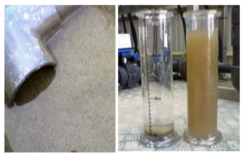
EC Floc formation and Raw & Treated Samples

Phase 2 upgrade and installation of 24x EC Reactors, floc tank and a new radial clarifier