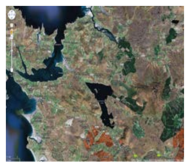
Bellanboy, County Mayo, Republic of Ireland