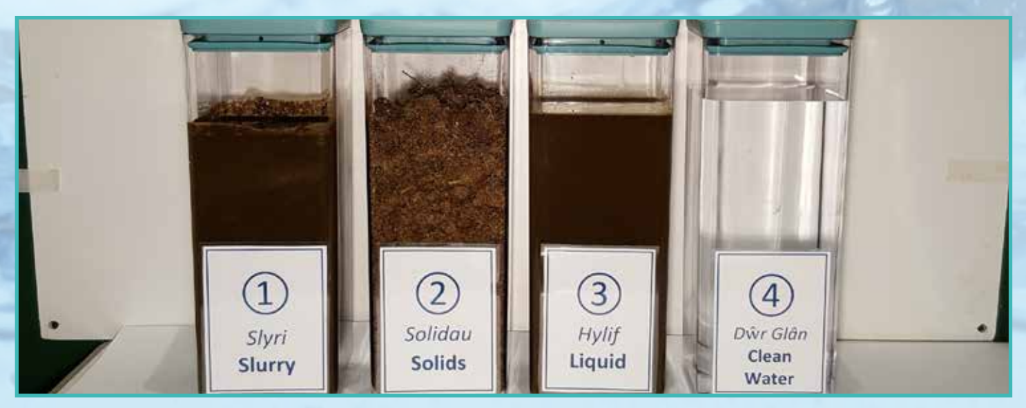
Copyright 2018. KP2M Ltd., (T/A Power & Water). All Rights Reserved.

There is an urgent, global need for a sustainable way forward in processing farm manures, storing of slurry and in the recovery and re-use of water, and the technology developed by Power & Water and Coleg Sir Gar's 'Prosiectslyri Project' has the potential to put Wales on the map by providing just that.