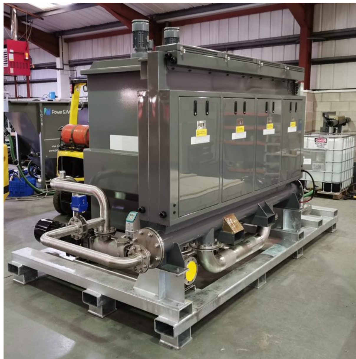
Power & Water Soneco® Wastewater Sludge Treatment System

"A resource which cannot normally be used...we turn it into approved fertilisers without the use of chemicals and without creating hazardous by-products..." - Norwegian Smolt Farm